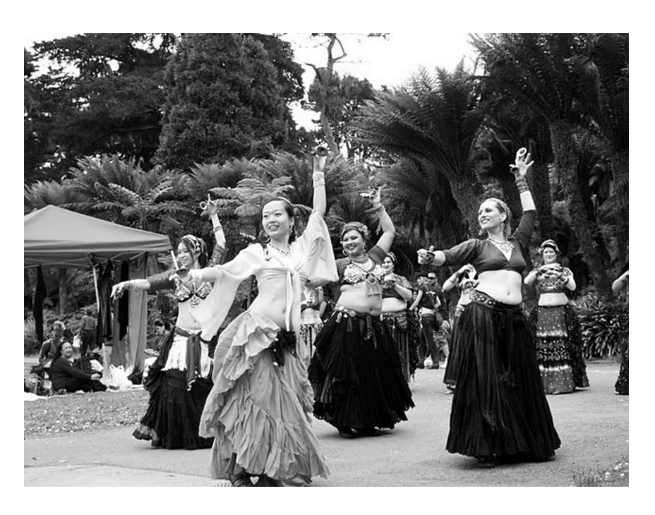
Figure 2. Red Lotus Belly Dance troupe in Golden Gate Park, San Francisco, 2007.

The belly dancing subculture loosely mixes symbols and references to the Middle East, various parts of Asia, and Africa. For example, April and her sisters wear Indian bindis (deco-