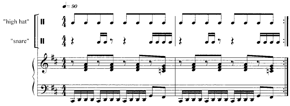
Example 3. The 'Sleng Teng' riddim.

production of riddims based on short ostinatos, rather than reliance on vintage B-side tracks, with their occasionally problematic chord progressions. Further, with its catchy and thoroughly novel-sounding timbres, 'Sleng Teng' promoted a departure from the overused Studio One classics, whose dominance in the earlier years has been cited as a sign of conservatism, or less charitably, lack of imagination (see, for example, Barrow and Dalton 2001, pp. 261, 275). Thirdly, in popularising the digital production of riddims (the trademark of what in the UK is called 'ragga'), 'Sleng Teng' showed how any aspiring producer with a keyboard synthesizer, sequencer, and drum machine, or access to these, could generate a new riddim, without having to spend money on studio time or studio musicians. Although sampling per se has only recently become common in dancehall, the use of digital techniques has greatly increased with the rise of personal computers, music software, and more sophisticated synthesizers. While posing a challenge to larger studios like Channel One, the digital era has also led to an exponential rise in the number of studios, large and small, and increased demand for keyboardists. (Meanwhile, as for Wayne Smith's voicing on Jammy's riddim, the song also perpetuated the dancehall tradition of adapting earlier tunes and phrases, with the catch phrase 'Under me sleng teng' reworking both Yellowman's earlier 'Under me fat ting' as well as Barrington Levy's 'Under mi Sensi'.)