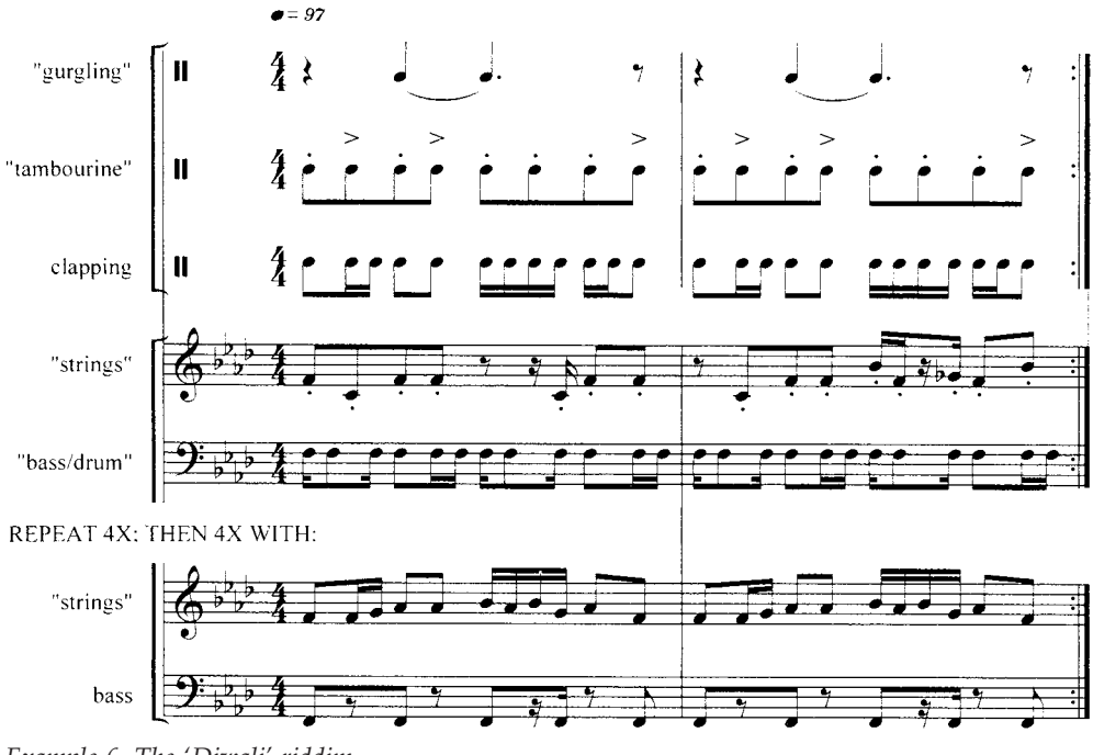
Example 6. The 'Diwali' riddim.

While the structure of dancehall songs merits more expansive analysis than can be provided here, a few general observations can be made. Most songs alternate verses and refrains. Before the 1990s, when a small set of relatively simple stock melodies were in vogue (like those in Example 2), there might not be a dramatic melodic contrast between the verse and the refrain, which would thus be distinguished primarily by the recurring and catchy text phrase (e.g. as in the case of 'Under Mi Sleng Teng'). More modern productions, particularly as emerging in the 1990s, generally present a greater contrast and thus have a more clearly defined structure. Typically, the verses are voiced using a simple, static melody, often based around one or two pitches, while the refrain is more melodic and is sometimes sung by the DJ and a back-up chorus and frequently 'doubled' by a synthesizer of some sort in order to provide further contrast.