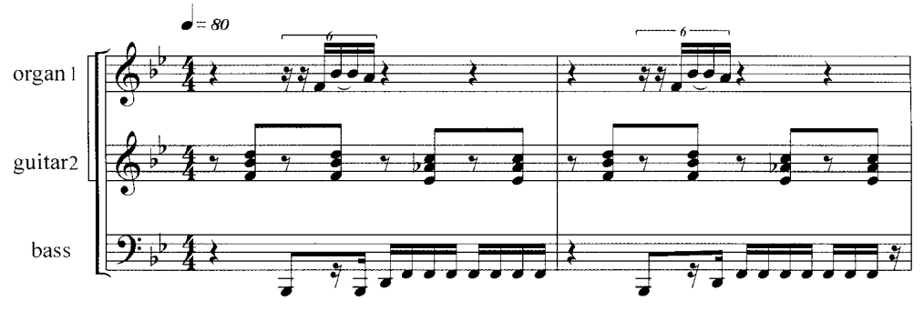
Example 1. The 'Real Rock' riddim.

Jimmy Cliff and others – with its more conventional 'song' format of melodies sung over extended chord progressions, often with bridge sections – was certainly familiar to and cherished by most Jamaicans, but since the latter 1970s it had come to constitute an internationally oriented music quite distinct from what the younger generation of Jamaicans favoured and were likely to hear at a Saturday night dance. Instead, the norm was dancehall – an older term now applied to the performance-oriented DJ art – in which a vocalist like Yellowman would voice, in a text-driven style with a simple, often one- or two-note melody, over a familiar riddim. The system prevailed both in record releases and in live shows, where aspiring DJs would line up to voice 'pon de mike' while the selector played a vintage riddim over and over. In the early 1980s the competitive spirit of the sound-system rivalry extended to record production, and producers rushed to release new DJ voicings over popular riddims. As Barrow and Dalton (2001, p. 275) note, 'By 1983, indeed, it was unusual for anyone to have a Jamaican hit employing a completely original rhythm track'.